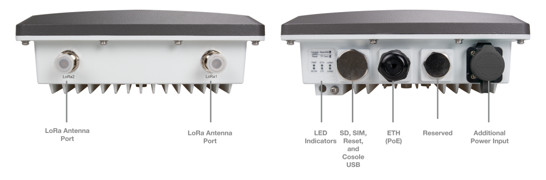
Figure 3: RAK7289 WisGate Edge Pro interfaces